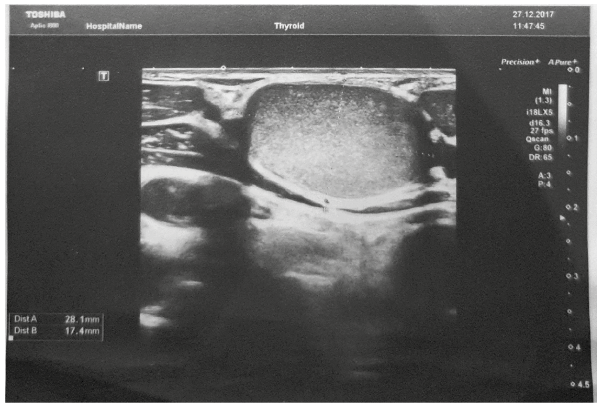
Figure 1. Neck USG performed at age 22 years. Visible cyst in the suprasternal regions

Surgery was successful, and the postoperative course uneventful. Histopathological examination of the removed