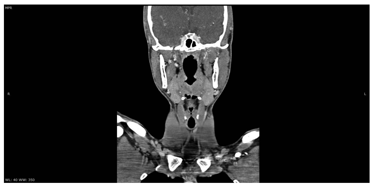
Figure 2. Computed tomography of facial skeleton and neck (frontal projection) of the patient at age 22 years with visible dermoid cyst in suprasternal regions

lesion confirmed that it was a congenital dermoid cyst of the neck. Histopathological diagnosis is shown in Figure 3. It shows a dermoid cyst with external focal adipose tissue necrosis; there is a multicellular granulomatous reaction (after BAC) at the same level inside the cyst. Surgical incision lines remained free of the pathological lineage. The cyst was filled with porridge-like masses.